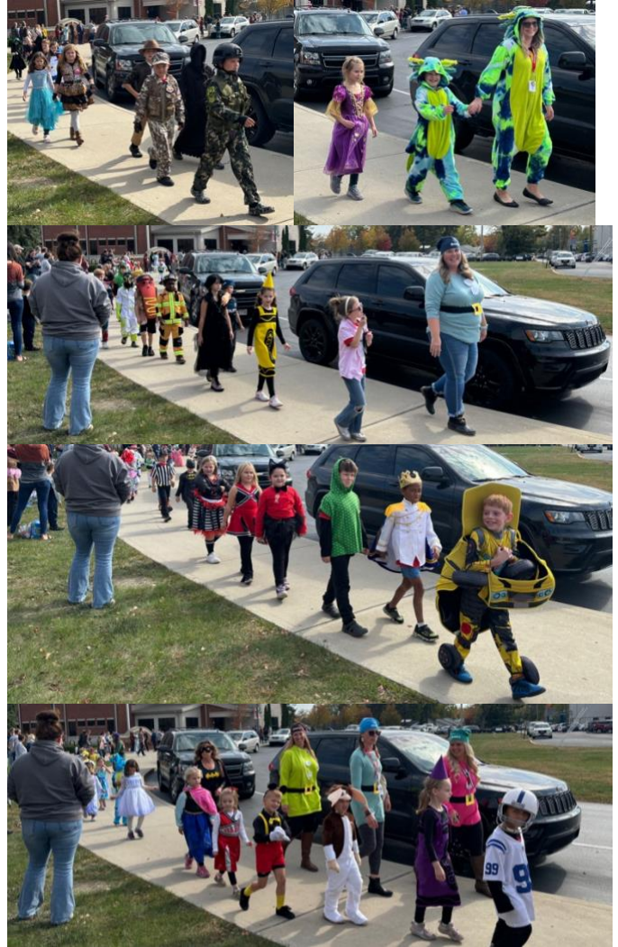
Career Awareness Event