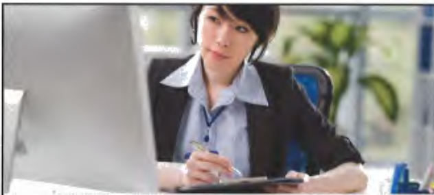
Other Title IX Coordinator Responsibilities